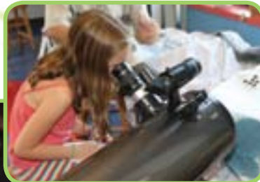
The Chamber piloted a STEM mentoring program for local students.