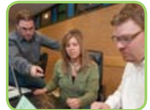
2011 Small Business of the Year Award winners, from left to right: Appetize, Inc. – HuHot Mongolian Grill, Insight Publications, Alpha-Prime, Inc. and Hoffman LLC.