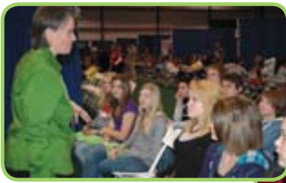
The career fair held by the Chamber inspired 3,000 students to choose a career in the sciences.