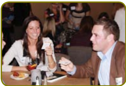
MeMe brought an innovative approach to traditional networking.